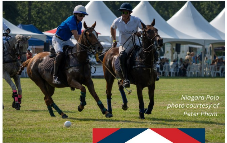
Niagara Polo