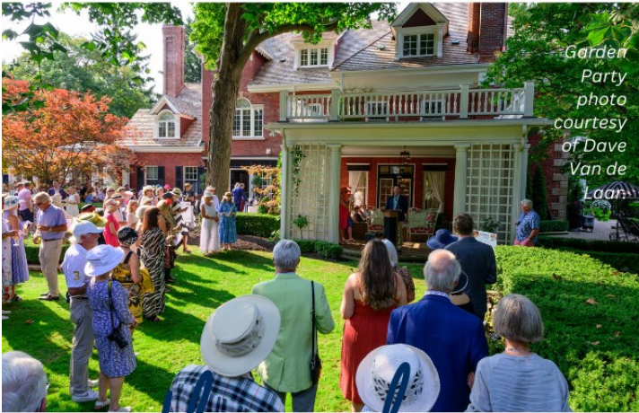
Garden Party