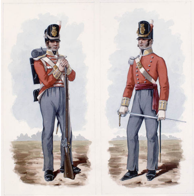
Private and Officer of the British 100th Regiment

Lieutenant General Drummond soon arrived and took possession of the fort. Several Canadian and First Nation prisoners were released.