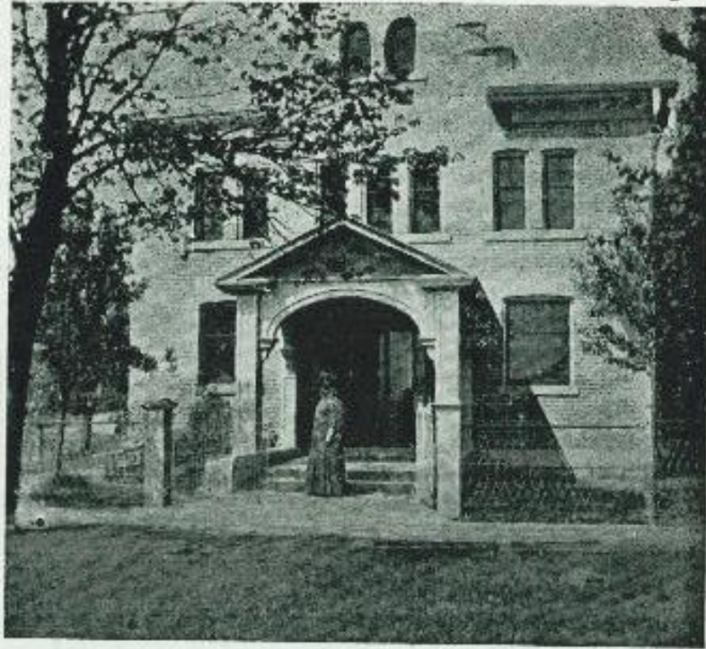
PORTICO, JUNE 1907