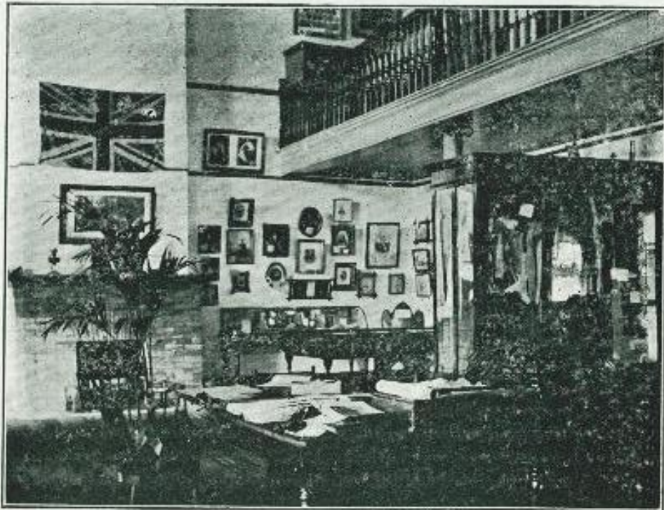
INTERIOR OF MEMORIAL HALL